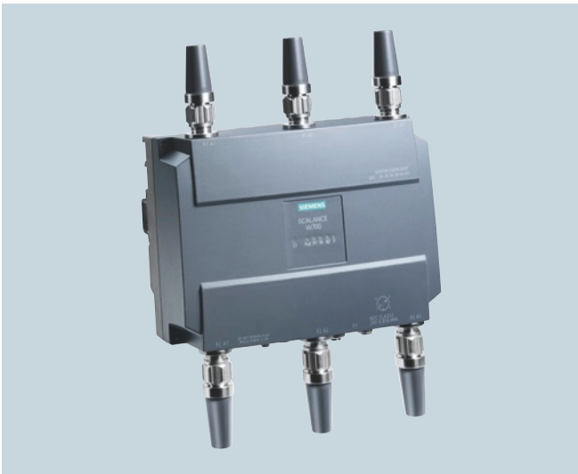
Rugged access point; version designed for special environmental requirements and use on buses and trains.

In order to replace defective components and bring them back into operation as quickly as possible, it also makes sense to also arrange the aggregation networks, such as the industrial backbone, directly in the plant – thus keeping the service path and the response time low. The ambient conditions in a production facility, a distribution station, or a filling or transfer line differ greatly from the climatic conditions in a data center or office. It therefore goes without saying that rugged components, for which spare parts will be available even after many years, must be used.