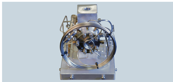
Single Train Column Module

Designing standardized applets as a module, with defined gas and electrical connectivity means you can maintain modules using existing practices or simply exchange them for an identical spare. Each module consists of a single or dual applet, each with a dedicated Model 50 valve for injection and backflush and a four channel TCD for detection and inter column monitoring.