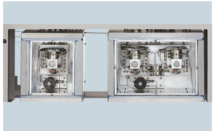
Single and Dual Applet Modules in a single and dual Modular Oven

5980 West Sam Houston Parkway North Suite 500 Houston, TX 77041 713-939-7400 ProcessAnalyticsSales.industry@siemens.com