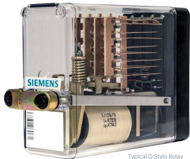
Typical Q Style Relay