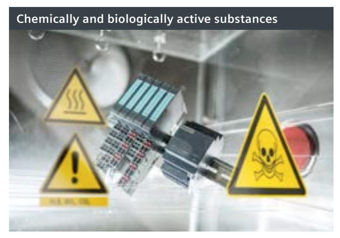
Videos about the SIPLUS extreme test methods are available on our website