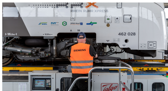
For the highest availability: At the Rail Service Center Dortmund-Eving, we service and maintain the electric multiple unit trains for the Rhine-Ruhr-Express (RRX), type Desiro HC

We provide all the spare parts needed for maintenance – with the help of our Easy Daily Spares. At the Rail Service Center Dortmund-Eving, we can offer you direct, professional contact with Siemens experts for support with spare parts and repairs, along with reliable stock management of defined parts thanks to flexible warehousing options. With our 3D printer in Dortmund-Eving, we can supply optimized spare parts with higher utility and lower costs, made on-site in a shorter time. This creates new opportunities for replacing and modernizing your parts and upgrading your vehicles with new components. Even complex part geometries can be made quickly, reliably, and flexibly, even in very small runs.