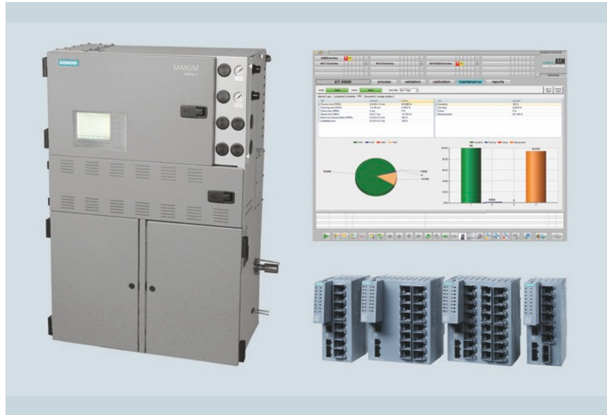
Siemens Analyzer System Manager, process gas chromatograph MAXUM and industrial network components SCALANCE X