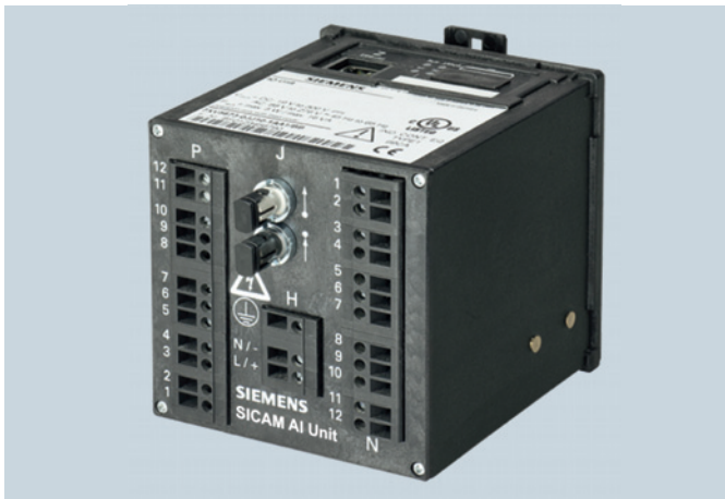
Fig. 13/30 SICAM AI Unit