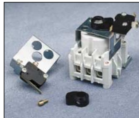
Auxiliary Switch Kits