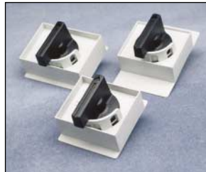
Rotary Switch Direct Mount Handles