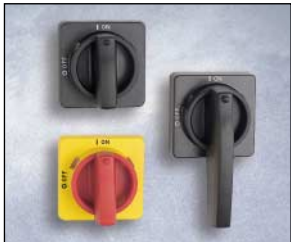
Rotary Switch Door Handles