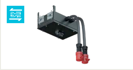
Cubic tap-off unit