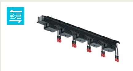
Trunking unit for overhead installation