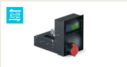
L-shaped tap-off unit