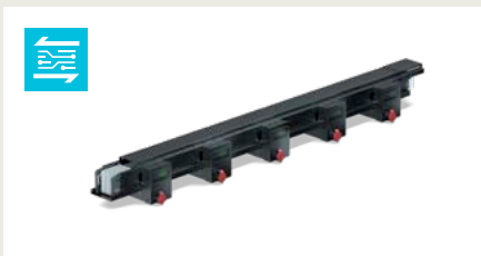
Equipment example for double floor