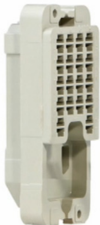
Un-drilled plugboard Part No. E7218/1