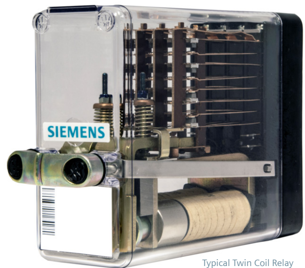
Typical Twin Coil Relay