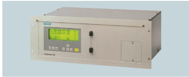
Fig. 3: ULTRAMAT 23

The information provided in this case study contains descriptions or characteristics of performance which in case of actual use do not always apply as described, or which may change as a result of further development of the products. An obligation to provide the respective characteristics shall only exist if expressly agreed in the terms of contract.