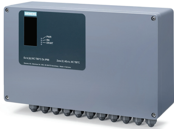
SIMATIC CFU PA in an aluminium housing