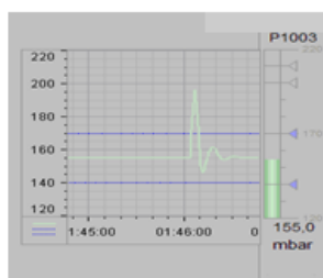
Trend display with bar graph supports decision-making