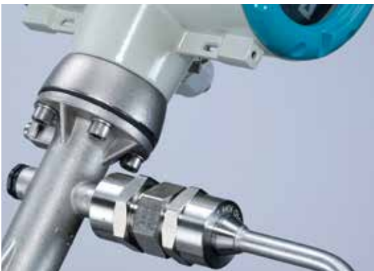
Maintenance couldn't be easier: the pressure sensor can be replaced without ever demounting the meter from the process line.