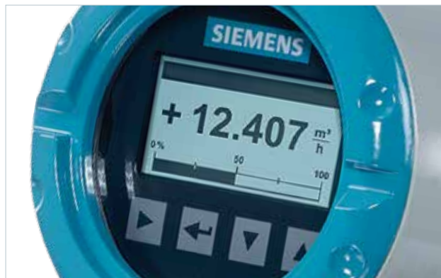
The user-friendly interface features a high-resolution graphical display with highly legible characters, a rotatable screen and a wide range of language options.