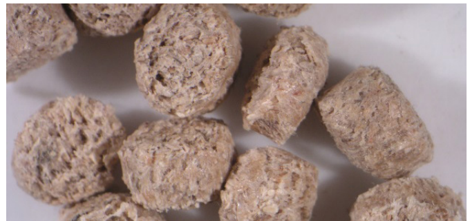
PerforMedia™ synthetic media