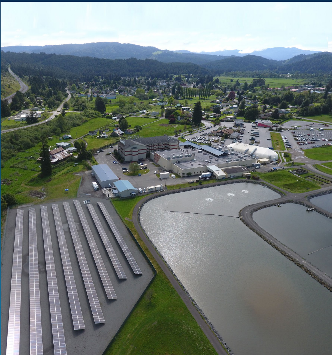
Blue Lake Rancheria Humboldt County, California

Microgrids contain all the elements of complex energy systems. They maintain the balance between generation and consumption, and they can operate on grid or in island mode. The Blue Lake Rancheria microgrid incorporates a Spectrum Power Microgrid Controller from Siemens, a solar array with 420 kW AC combined with a 2,000 kWh lithium-ion battery storage.