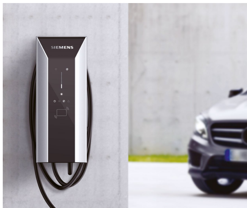
Siemens Smart Infrastructure has deployed 65,000 EV charging stations throughout the U.S.

Automated and equipped with advanced technologies, energy-efficient buildings use less energy, and offer healthier indoor environments. By focusing on investments and upgrades in automation, lighting, fire safety and security for critical building infrastructure and new construction, as a nation we can ensure that we can keep infrastructure operating during future crises while providing a short-term payback on operational and energy reductions. Siemens manufactures critical building products in Buffalo Grove, IL and designs and develops next generation life, fire, and safety solutions in Florham Park, NJ.