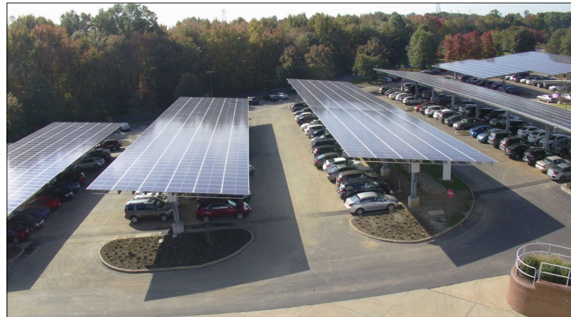
Siemens Technology is headquartered in Princeton, NJ with employees advancing R&D and innovation across the U.S.

Over the last three years in the United States, the number of annual billion-dollar weather disasters has more than doubled compared to the long-term average. For the many cities at risk, resiliency planning has emerged as a growing priority. Resilient cities are smarter, energy-efficient, and more adaptable in meeting the needs of residents, businesses, and visitors especially with critical improvements to infrastructure and technology. The frequency and severity of weather events like hurricanes, tornadoes, ice storms, and extreme heat waves are continuing to increase. However, there are several proactive, long-term steps that can be taken by forward thinking municipalities, including strengthening power system resiliency and simulation planning to identify resiliency gaps, to help modernize energy systems.