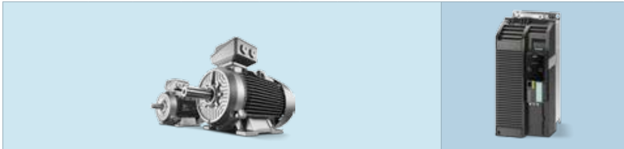
SIMOTICS reluctance motor (VSD4000 line)