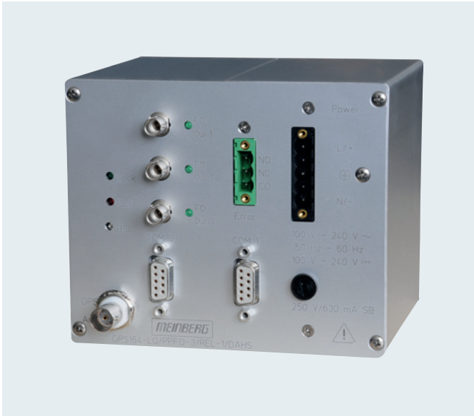
Fig. 13/126 GPS Time Synchronization Unit 7XV5664-1