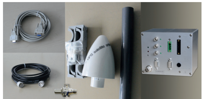
Fig. 13/127 Additional components