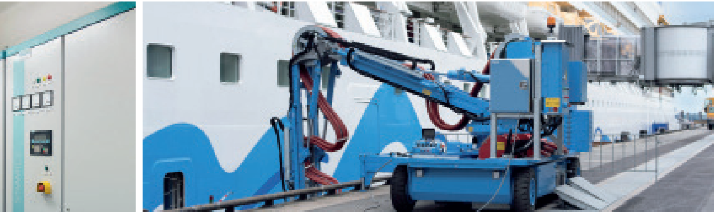
Quick and easy connection to the ship via the cable management system