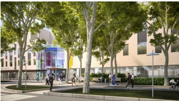
'Peel Memorial Centre for Integrated Health and Wellness - Architectural Design: Diamond Schmitt Architects and RTKL