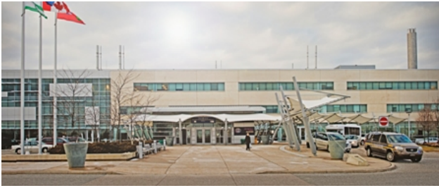
Brampton Civic Hospital