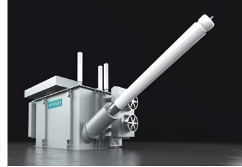
Illustration of the mobile resilience transformer with plug-in bushings.

» These mobile and flexible transformers are an innovative product that shows our commitment to grid resilience. This offer is backed by an attractive service portfolio ranging from maintenance and repair to financing.«