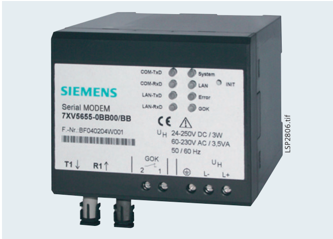
Fig. 13/62 Front view of the Ethernet modem