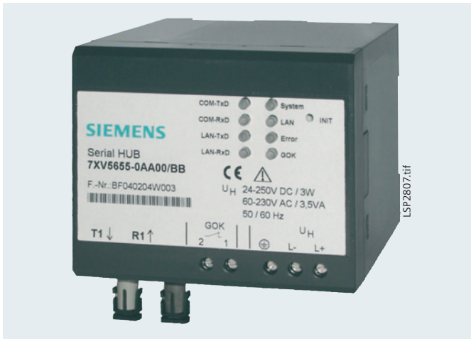
Fig. 13/64 Front view of Ethernet serial hub for substation