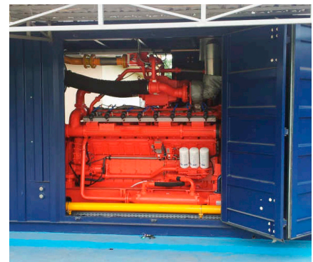
SGE-56SM containerized generator set.

The PKS Tandun project activity is estimated to treat approximately 148,575 m 3 of POME annually and reduce emissions by approximately 15,589 tCO 2 e. The PKS Sei Tapung