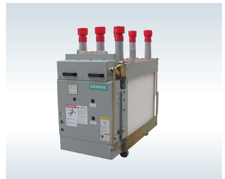
Siemens AMR (replacement for Allis-Chalmers AM)