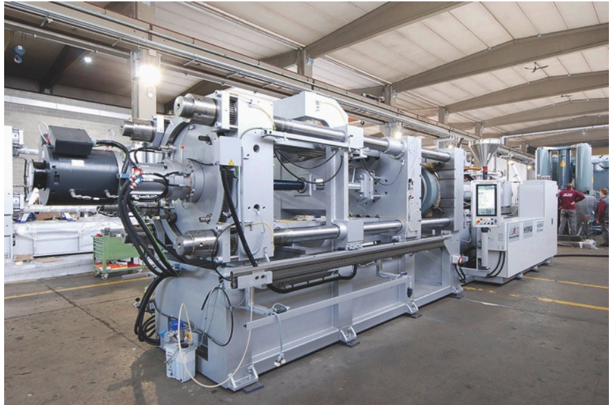
Maicopresse M-L 600 Hybrid: Robust mechanical engineering meets innovative, modular automation from Siemens. On the left in the foreground: the SIMOTICS T-1FW3 torque motor, which performs fast, precise opening and closing movements of the toggle lever.

The new, open controller integrates the functions of a PC-based software controller with a visualization, PC applications and central input/output modules (I/Os) in a very compact design. The pre-configured software variant of the SIMATIC S7-1500F ensures high PLC performance with integrated safety functions. The compact "all-in-one" system is also the platform for visualization solutions with SIMATIC WinCC Runtime and other PC applications. It provides PC interfaces for the monitor (DVI), mouse, keyboard as well as PROFINET and Gigabit Ethernet and can be expanded in a decentralized manner. "Hardened" for continuous operation at temperatures up to 60 °C without loss of performance, the diskless and fanless, shock and vibration-resistant device is predestined for use in serially produced machines in the harshest conditions. The openness and scalability allow dedicated, cost-optimized automation solutions in each case. This allows Maico to implement individually tailored machines for all requirements in the future. As a global partner, Siemens guarantees a worldwide supply of replacement parts, comprehensive support, and innovative further developments for its customers.