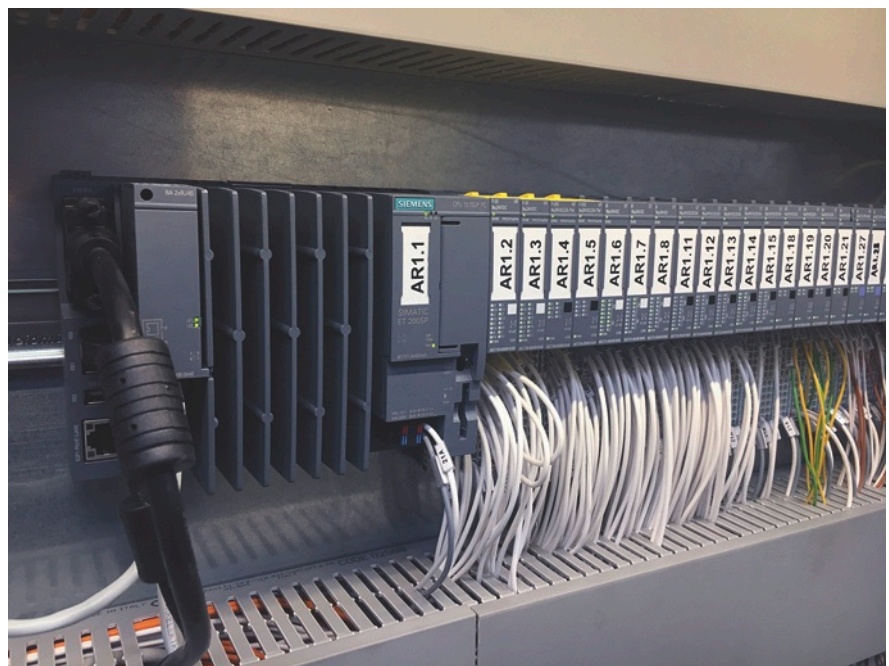
The SIMATIC ET 200SP Open Controller integrates the functions of a PC-based, fail-safe software controller in a very compact design, with visualization, PC applications and central input/output modules (I/Os). The fanless device is resistant to continuous temperatures up to +60 °C and is thus predestined for use in injection molding machines.