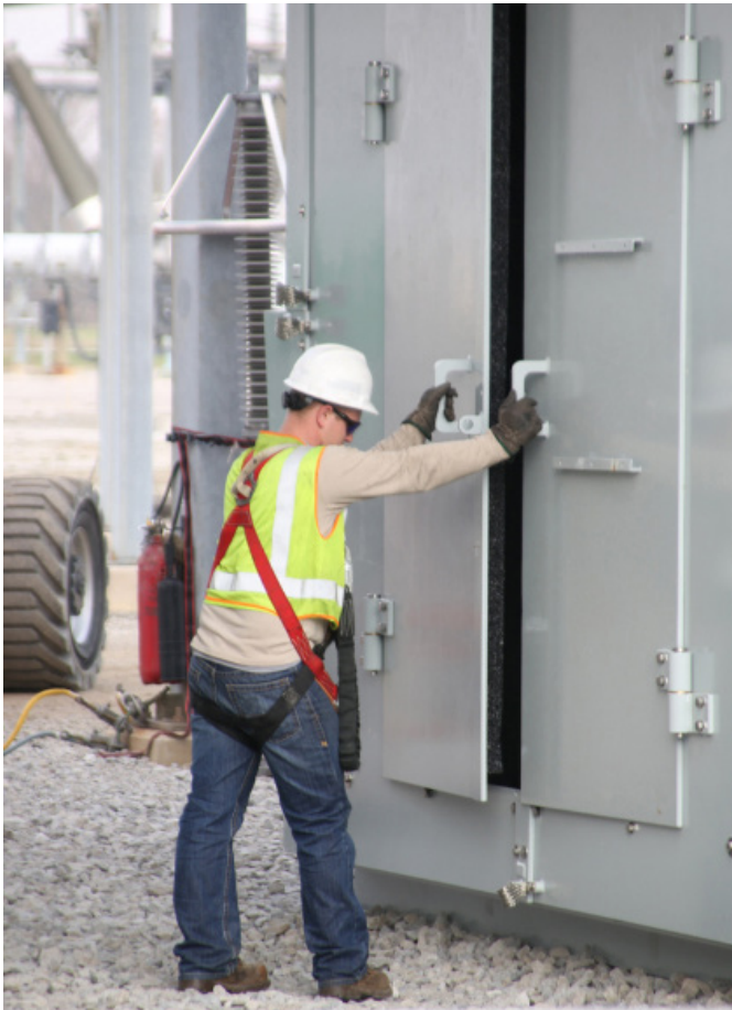
The system allows for easy access to key components during operation of the transformer.