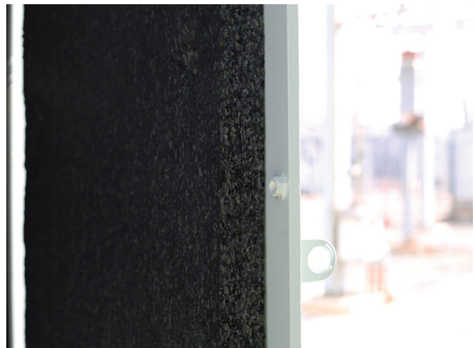
Neoprene insulation can be used to reduce transmission vibrations from the transformer tank, thus reducing noise.

Bullet resistant panels can be adapted to significantly reduce acoustic emissions. This may be particularly beneficial in urban areas. The bullet resistant panels encase the transformer, including cooling fans.