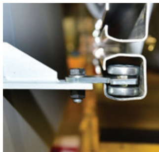
The system allows for easy access to key components during operation of the transformer.