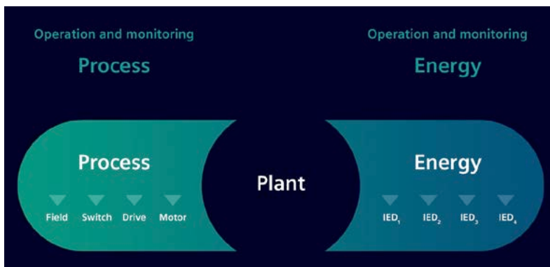
Fig.1: Combination of the systems in terms of process and energy and Fig.2: TIA Station Gateway

With Power Control Integration Services, electrical switchgear with devices for protection and control functions (intelligent electronic devices or IEDs) can be homogeneously integrated into the SIMATIC PCS 7, TIA Portal or WinCC process control system – based on the IEC 61850 standard. This significantly increases the level of integration of the overall system.