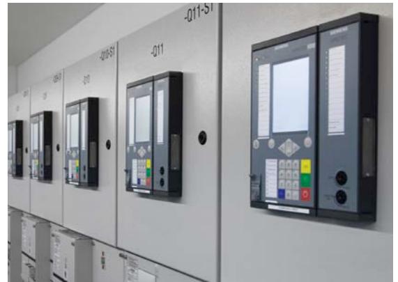
Fig.4: Integration of SIPROTEC5