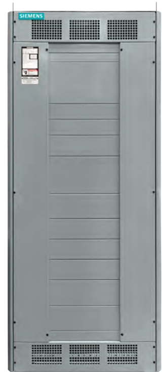
SBEDEF200TNE SBCDEF200TNE 2000A Distribution Section