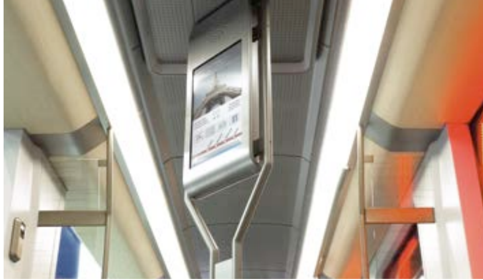
Inspiro Interior with Virtual Conductor

The vehicle concept was developed in accordance with the latest crash and fire protection standards, and the car body