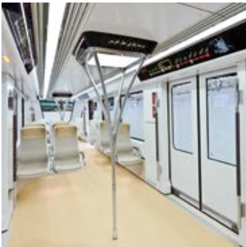
Interior Metro Riyadh

During development, special attention was given to ensuring easy replacement of worn parts and spare parts and to component