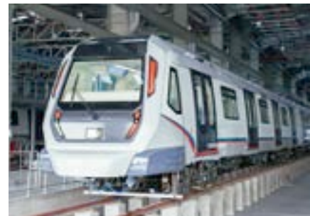
Metro Kuala Lumpur