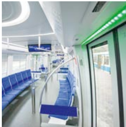
Interior Metro Munich

has an enhanced compressive strength of 1,000 kN. Ultramodern interior video monitoring, fire alarm, and firefighting systems can be installed.