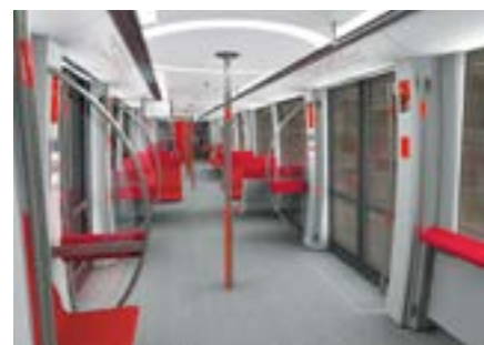
Metro Nuremberg G1 Interior