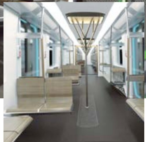
Inspiro Interior with Lighttree

The exterior's dynamic front end and large windows are striking and elegant, and make a lasting impact on the city's image.