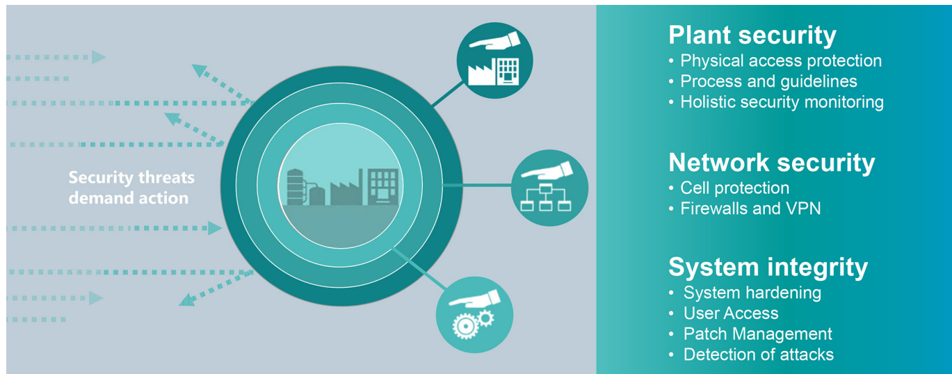
Figure 3: Cyber Security & Defense-In-Depth