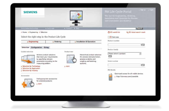
Configure your devices using our PIA Portal: www.usa.siemens.com/pia-portal