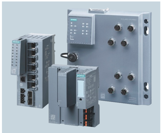
SCALANCE X products for the use in the process industry

Each SCALANCE XF-200BA switch supports up to four 100 Mbps ports. To minimize the number of broadcasts in the network, virtual LANs (VLANs) divide the physical network into virtual areas. A high availability of machinery and equipment is provided by redundancy protocols – such as the HRP protocol ( H igh S peed R edundancy P rotocol) and the MRP protocol ( M edia R edundancy P rotocol). In the event of a fault, these protocols are used to switch over to the redundant path without a loss of communication. These and other functions – such as RMON ( R emote N etworking M onitoring) and link aggregation – complete the firmware spectrum.