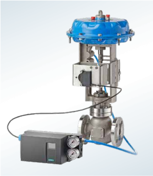
SIPART PS2 with Non-Contacting Sensor (NCS): Linear Application

Linear displacement sensors can also be utilized. Typically, long valve stroke applications require extended feedback arm assemblies, which increases the valve's installation dimensions. Linear sensors and their shafts are mounted in parallel with the valve movement, thus providing a position sensor that is directly proportional to travel and reducing the valve's installation size.