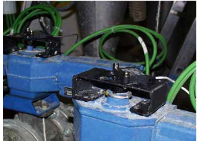
Non-Contacting Sensor (NCS): Rotary Application

Limit switches, either mechanical or proximity technology, are utilized to obtain valve limit detection that is independent from the positioner's CPU. However, this can only occur if there is a mechanical connection to the movement of the valve stroke. The RDU utilizes a mechanical linkage to obtain its position signal, thereby allowing limit detection modules to be installed onto the same connection in a shared housing. This is in contrast to traditional setups, which require customers to accommodate mounting for two limit switches and the positioner.