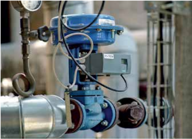
A Remote Detection Unit (RDU) provides position feedback to a valve positioner mounted in a more accessible location