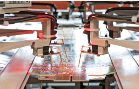
SIEMENS transformers used in semi-conductor industry.