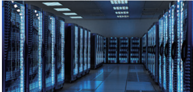
SIEMENS transformers in several large data centers all over the world.