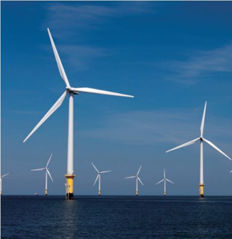
SIEMENS transformer in wind power.