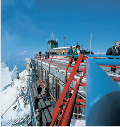
SIEMENS transformer on top of the Alps Mountain.