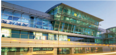
SIEMENS transformer used in Ataturk airport.