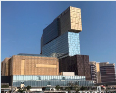
SIEMENS transformer in MGM hotel in Macau.