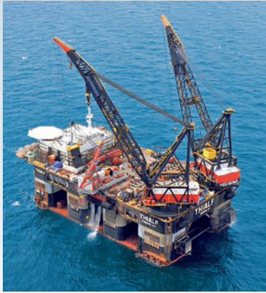
SIEMENS transformer in deepwater drilling platform.