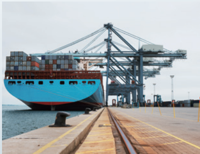
SIEMENS transformers in cranes at the harbour.