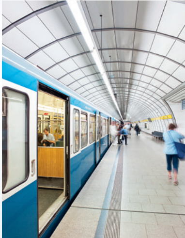
SIEMENS transformer in the subway.