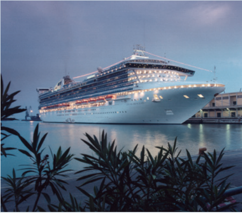
8 units SIEMENS rectified transformer used on the luxury cruise ship "Grand princess"