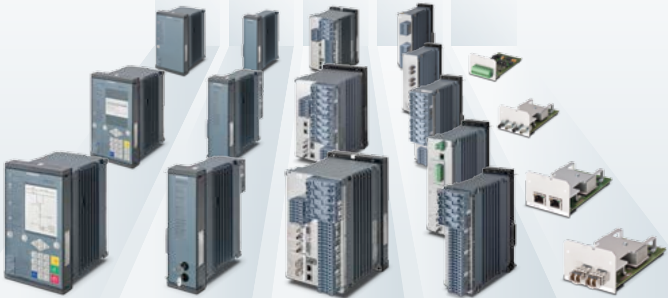
On-site operation panels for base modules