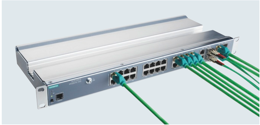
Large number of ports in a small space – the new SCALANCE XR328-4C WG enables the space-saving connection of up to 28 terminal devices in a very small installation space in a 19" rack.