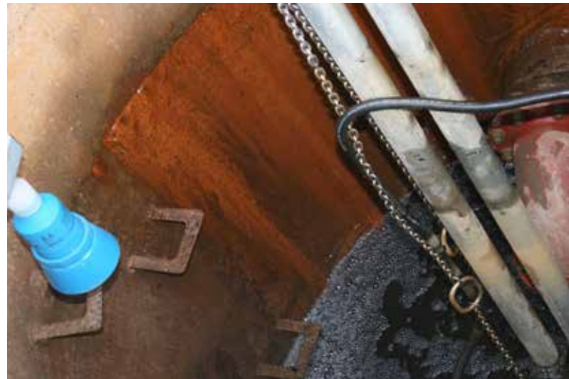
Figure 1: During peak periods, the pump operating range is much smaller than in normal operation, reducing the amount of time pumps must run.