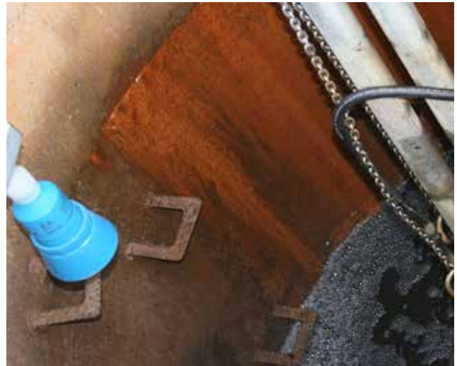
Siemens Echomax transducers installed in the well and the SITRANS LUT400 controller measure the level of water and control pump operations.

These are great practices and are sure to save you money each month. But what about creating energy cost savings in the millions of dollars? Siemens' newest SITRANS LT500 HydroRanger level controller with mA/HART sensor inputs and SITRANS LUT400, helps wastewater treatment facilities save significant amounts of money each year.