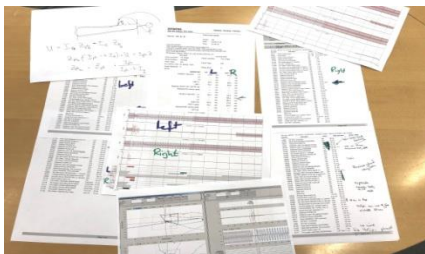
Figure 2: Example of documentation for an in-depth analysis of a test case

After a certain system disturbance has been simulated using RTDS, the fault logs are analyzed, and the fault records are thoroughly evaluated (Figure 2).