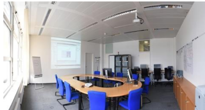
Figure 3: Meeting room (RTDS testing) at Siemens AG premises in Erlangen, Germany

against the actual response of the tested system at a glance. Customers can discuss the power system and relay behavior with Siemens PTI experts. A customer meeting room equipped with flip charts and projector allows detailed discussions (Figure 3).