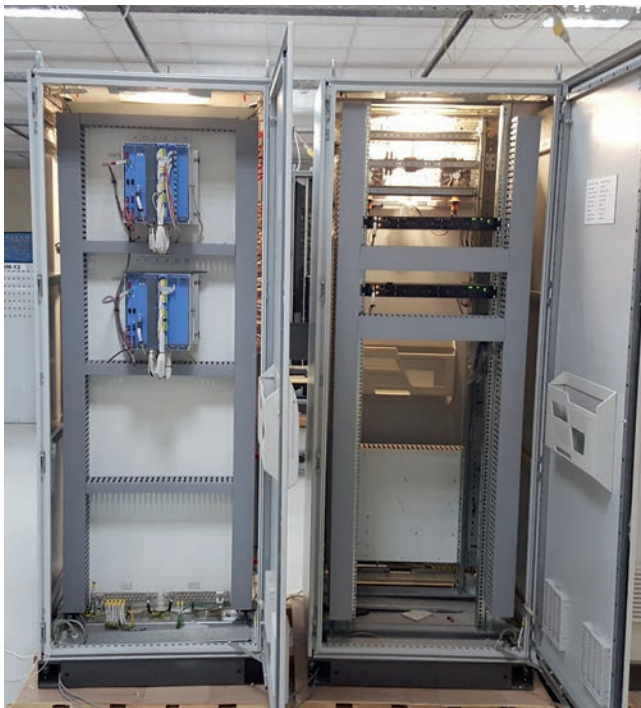
RUGGEDCOM RSG2100 switches in RTU cabinet

She added that the switch’s versatility was another major advantage. “They are modular and very flexible when it comes to design,” she describes. “I don’t need to use different switches. I can use the same switch and add the modules as per my requirements. And they are really easy to configure and manage.”