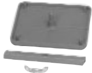
Hub Cover Plate