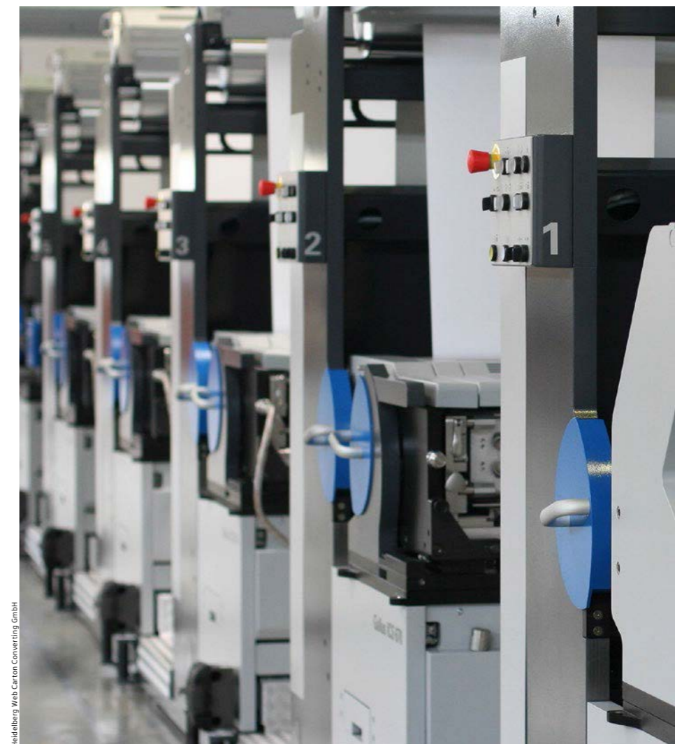
The completely modular ICS 670 inline converting system is designed to enable highly flexible production of extremely refined packaging products

➤ siemens.com/printing ✉ joerg.reh@siemens.com