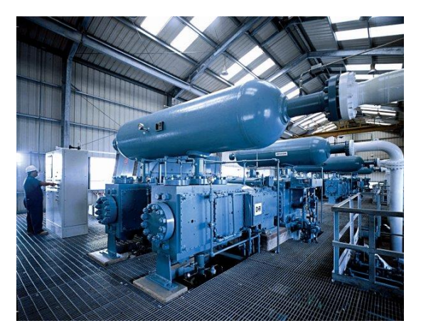
Above: There are more than 3,000 HHE-class compressors in operation worldwide today.

Installation and commissioning of the equipment are slated for 2022.