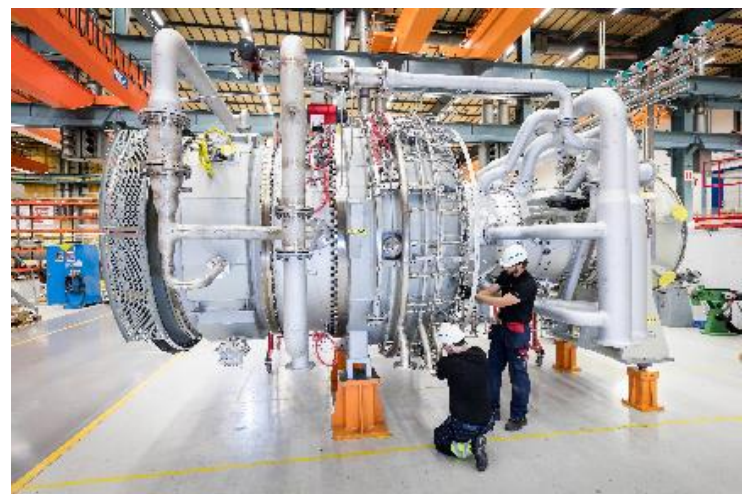
Above: Four SGT-800 industrial gas turbines will enable the cost-effective expansion of the Balikpapan refinery.