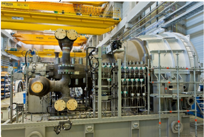
Above: Siemens SST-600 steam turbine tailor-made design; actual design depends upon project conditions.