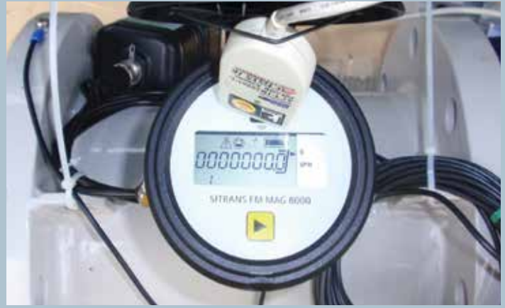
An infrared IrDA interface offers the ability to upload or download data via laptop.

Subject to change without prior notice Order No.: PIFL-00079-0719 All rights reserved ©2018 Siemens Industry, Inc.