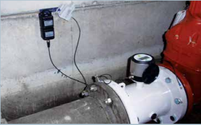
The MAG 8000 is flexible enough for installation virtually anywhere, including district water lines.