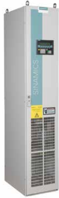
G150 type C with transport eye bolts (tophat removed)