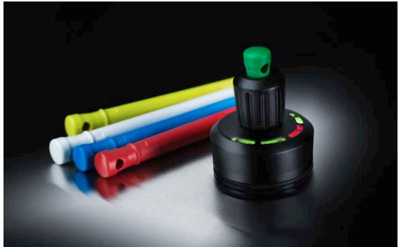
SIRIUS ACT RFID keys

Yet there is more to the technology than simply providing tailored equipment access to designated operators. Accountability plays an important role. For example, Operator A at the start of the shift inserts the RFID key. The system identifies Operator A, records the date and time, and notes equip-