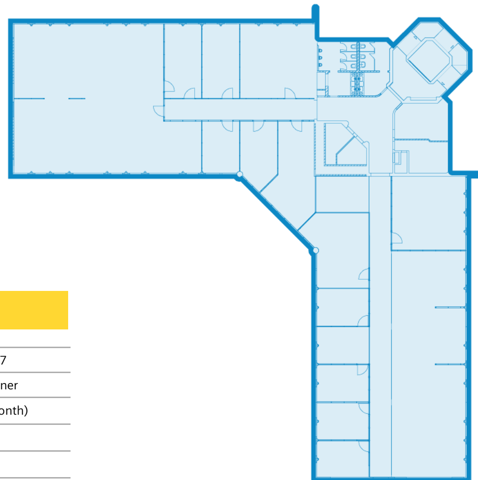
Example floor plan - 2nd floor

Cost-free advising for room and space planning as well as for conversion measures