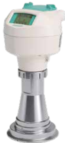
SITRANS LR250 HEA