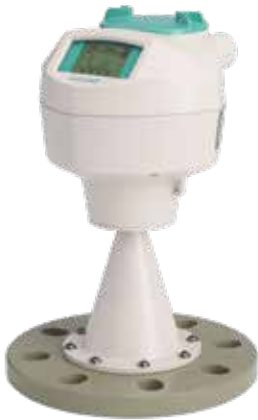
SITRANS LR250 PLA

SITRANS LR250's complete range of antennas and process connections makes this transmitter suitable for nearly any liquids application. Built to last, these antennas give you liquid level flexibility for inventory and process vessels.