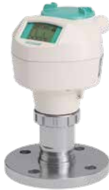
SITRANS LR250 FEA

TFM™ PTFE lens offers extreme corrosion resistance.