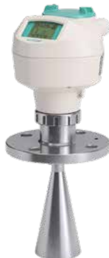
SITRANS LR250 Horn