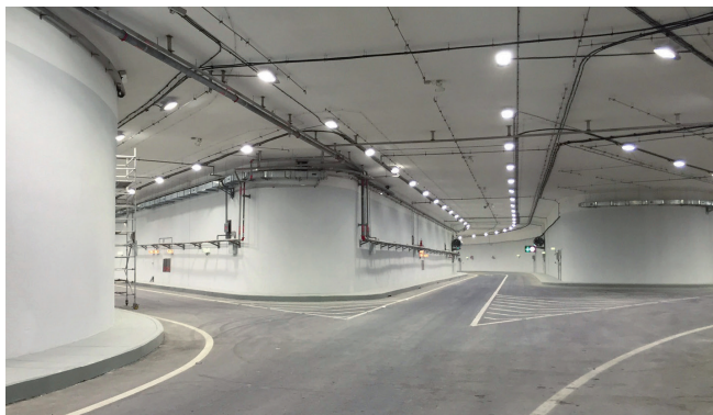
The 1.2-kilometre car tunnel linking Saadiyat Island to the city is equipped with the latest network equipment from Siemens.

As space in the tunnel is so limited, all the field switches needed to be ultra-compact, yet still maintain sophisticated functionality. They also needed to withstand difficult environmental factors such as extreme heat and humidity, a lot of dirt, constant vibration, and a heavy dose of electromagnetic interference. In addition, the creation of the network needed to keep pace with an overall timeline for the construction of both the museum and tunnel which was highly ambitious. So product delivery, installation, and testing all had to be managed within a matter of months.