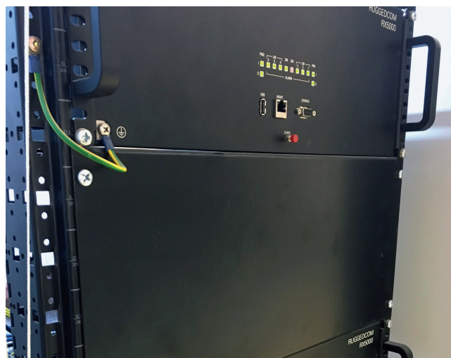
The RUGGEDCOM RX5000 integrated switch and router is a high-port-density Ethernet routing and switching platform designed to operate in harsh environments – like that of the tunnel to Saadiyat Island.

RUGGEDCOM NMS – A fully-featured enterprise-grade network management software based on the OpenNMS platform, this solution is specifically designed for the rugged communications industry, providing a comprehensive platform for monitoring, configuring and maintaining mission-critical IP-based communications networks.