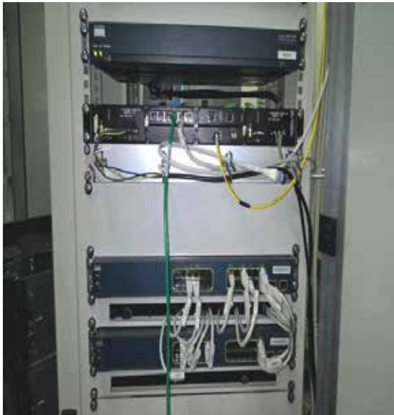
The network infrastructure was implemented using layer 3 switches and virtual routing. As a multiservice network component, the RUGGEDCOM RX1500 combines the Ethernet functions of a switch, router, and firewall.

The network of the control system needed to be divided into several virtual LANs (VLANs) i.e. the process LAN for checking the booking or customer information systems. A layer 3 switch, like the RUGGEDCOM RX1500, is ideal for this task.