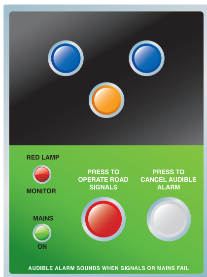
Full Activation Box